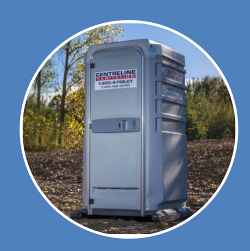
Before partcipants leave

Participants will proceed down the finishing Chute and take a pre packaged finishers bag from the table. There is bottled water and a few special "treats" in here for our runners. Volunteers here will use gloves when restocking the prepackaged bags. Hand sanitizer will be available here.