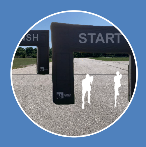
Start Line 30 seconds

There are 3 portable washrooms with handwashing stations onsite inside the gated race area. Participants are free to use these as needed, even if it means stepping out of line. There will be plenty of line up room to accomodate thoes who return to the line. There are sanitizing wipes outside of each washroom. Please clean all touch points before using the washroom. These will also be cleaned hourly.