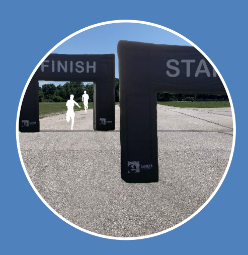
Finish Line -15 seconds

Participants are to bring their own water as there will be NO on course water station. However as a precaution and safety measure, at our mid point cheer station we will have sealed bottled water available. Volunteers setting up any bottles will wear gloves. Also when participants finish there is a bottle of water in their take home bag.