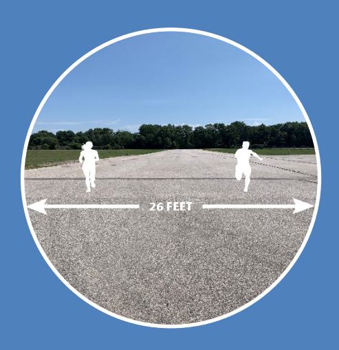
Running the Course 15-40 minutes

Once running keeping a physical distance should be easy, the starting part of the course is 26 feet wide and the main runway is 200 feet wide. There are guidelines for on course do's and donts. St. John Ambulance will provide on course first aid.