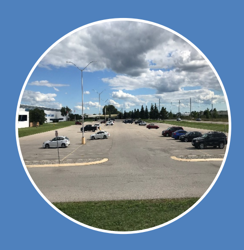
Arrival and Parking

Participants will be given an arrival time and an assigned parking lot. There are three parking lots which we will restict to 30 parking at a time to conform to physical distancing. Please do not arrive more than 5 minutes before you scheduled time. If you need to warm up or streatch there is space by the parking area to do this prior to entering the race area and another large field inside.