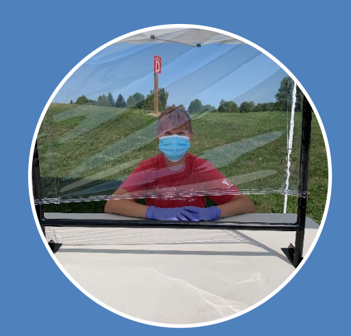
Screening -1 minutes

Participants will be given an arrival time and an assigned parking lot. There are three parking lots which we will restict to 30 parking at a time to conform to physical distancing. Please do not arrive more than 5 minutes before you scheduled time. If you need to warm up or streatch there is space by the parking area to do this prior to entering the race area and another large field inside.