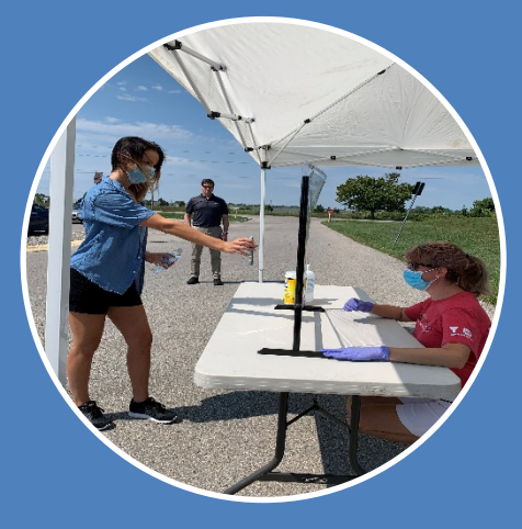
Registration/Bib Pick up 2 Minutes

Here you will be asked to review a series of questions for screening of all attendees. Once a participant has passed the Co-Vid Screening they will be given a buff to wear on site or they can bring their own face mask. Should a participant not pass the screening they will not be permitted to enter and race. The path throughout the event is marked with physically distancing spacing where ever there could be a wait.