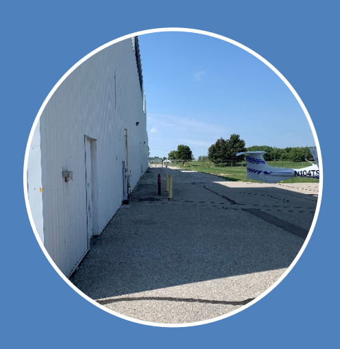
Race Line Up 30 seconds - 2 minutes

Inside the gate is a line up area with spaces marked for runners to line up, and proceed to the start line. The start line accomodates 2 at a time every 30 seconds. There will be 2 volunteers helping to keep the line moving.